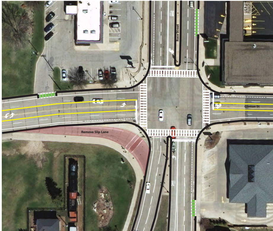
Short Term Option: Close the Slip Lane and Maintain Rose Street and Copeland Avenue as One-Way Streets