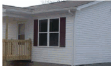
CANNOT (All Vinyl)