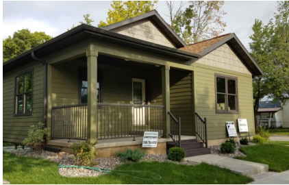
CAN (LP Smart Side)