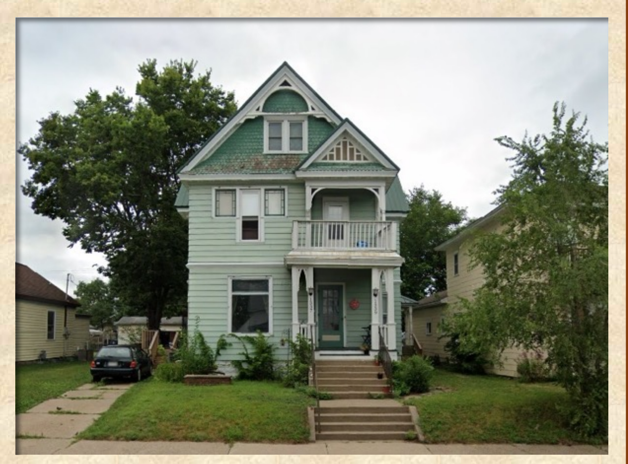
Ca. 2019.