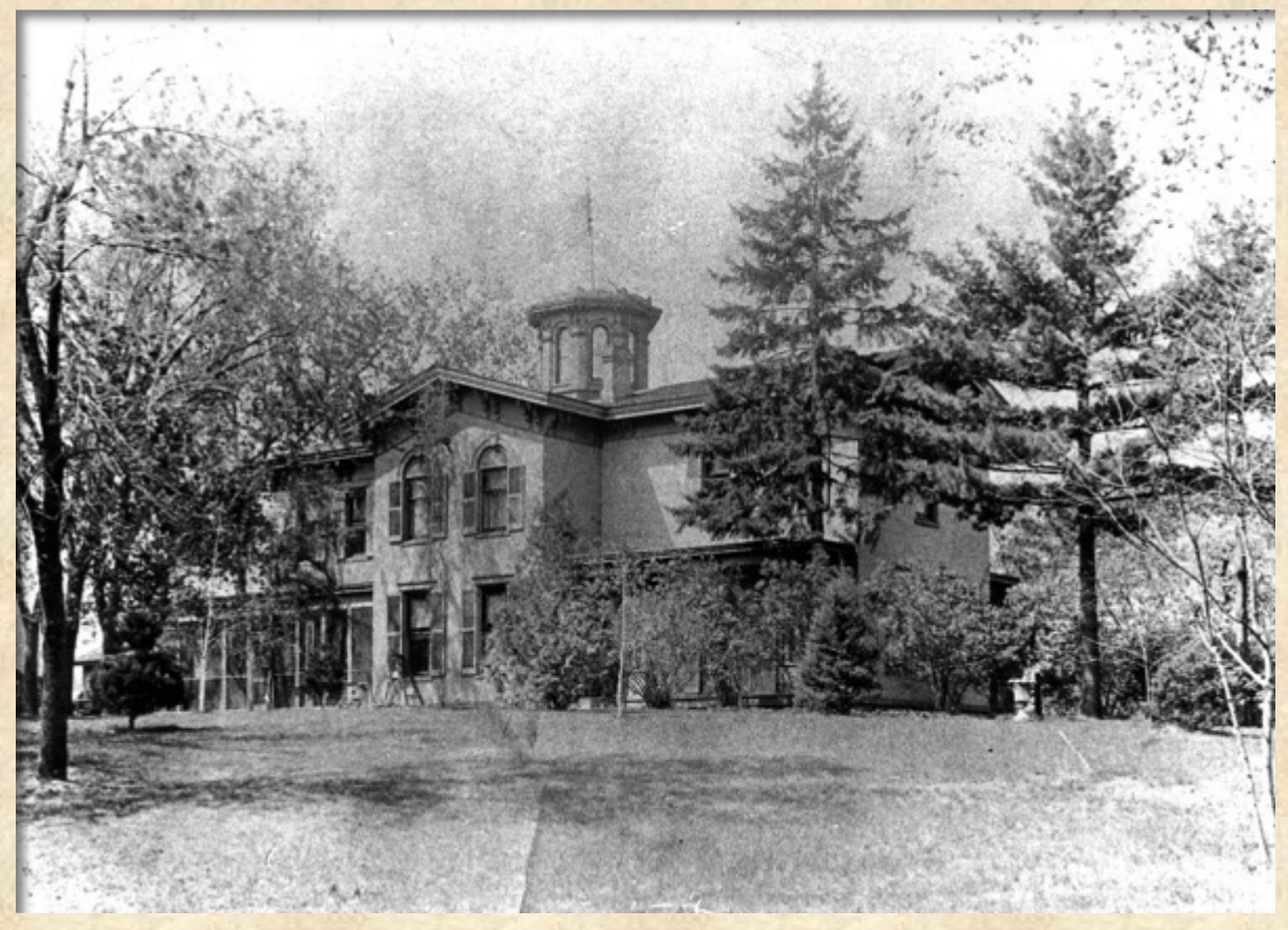
Ca. 1890.

Founded flour mill in Minneapolis which later became the General Mills Co.