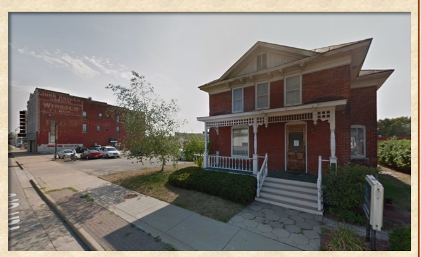
Ca. 2012.

John Halverson House is a rare example of a residential home remaining downtown.