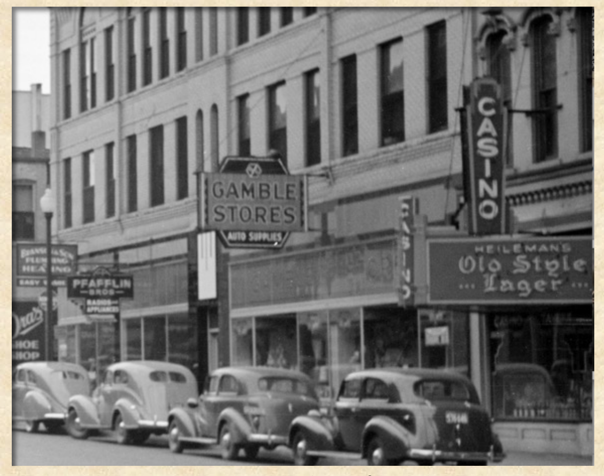
Ca. 1939.

Has operated continuously as The Casino Tavern since the end of Prohibition in 1933.