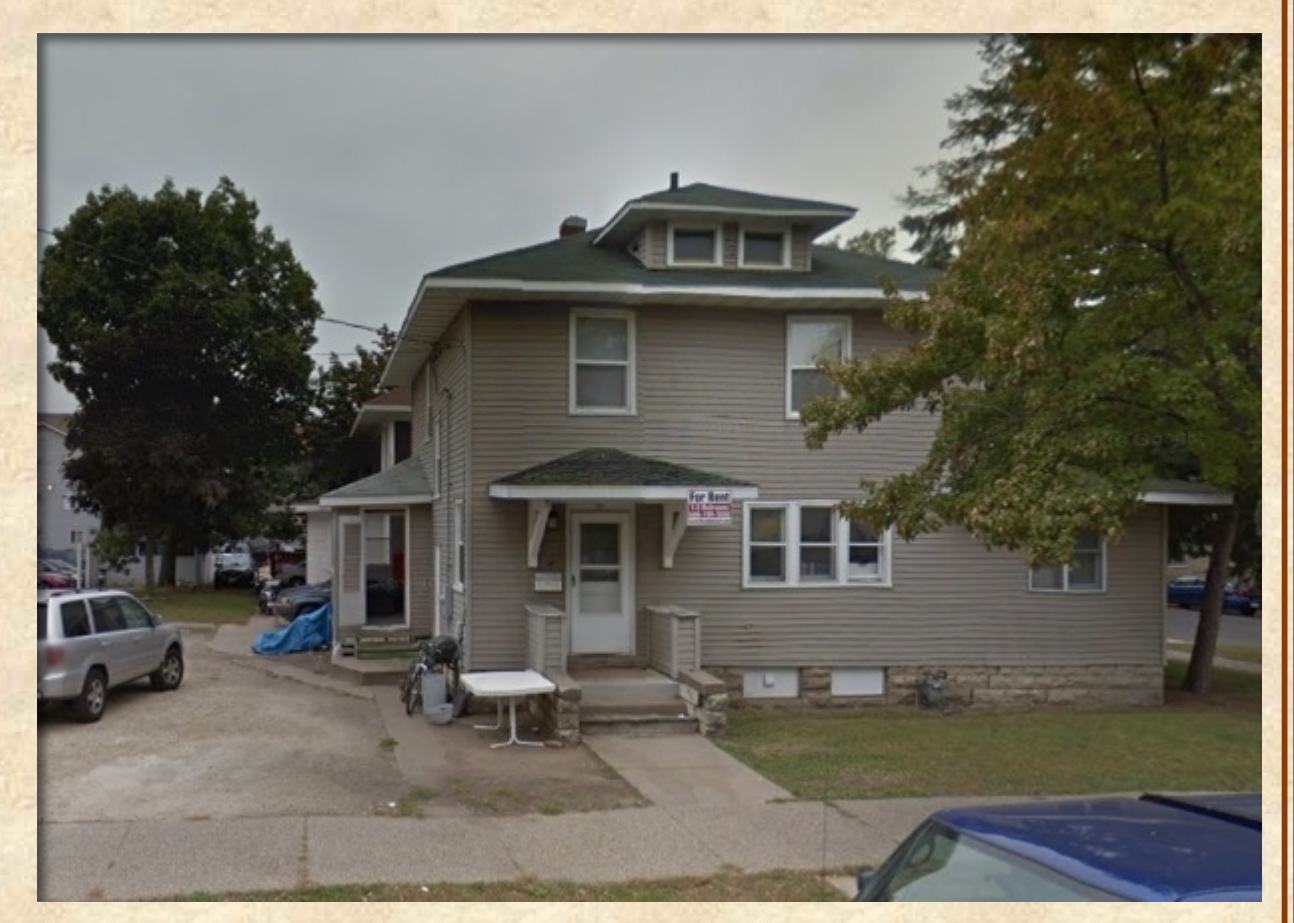
Ca. 2019.

Row of three American Foursquare homes possibly designed by well-known builder.