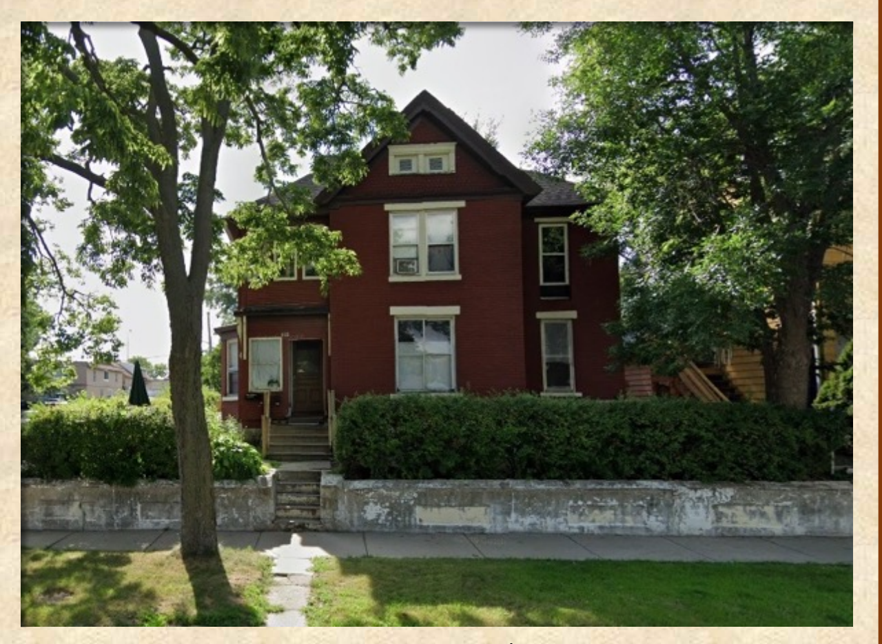
Ca. 2019.

Retains many historic building elements.