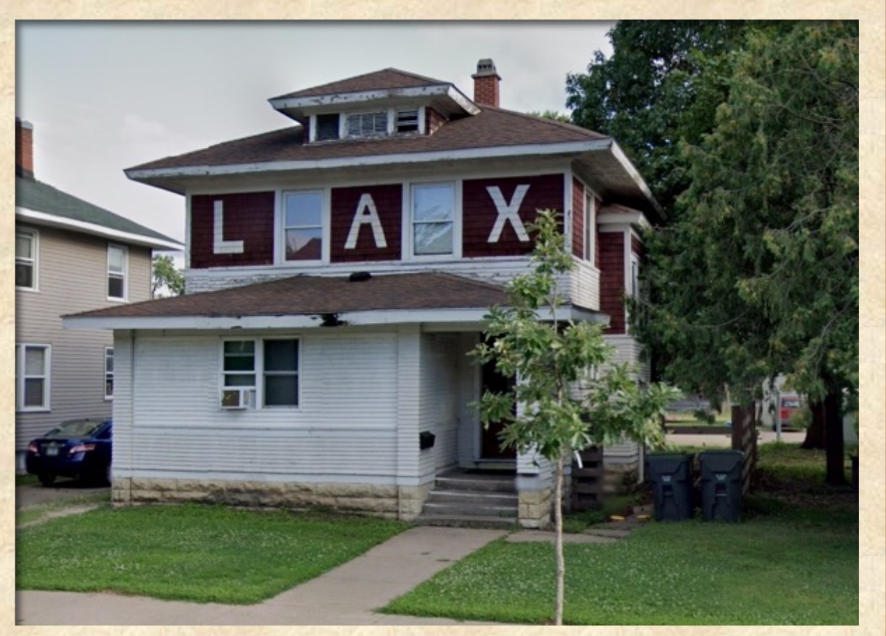
Ca. 2019.

Row of three American Foursquare homes possibly designed by well-known builder.