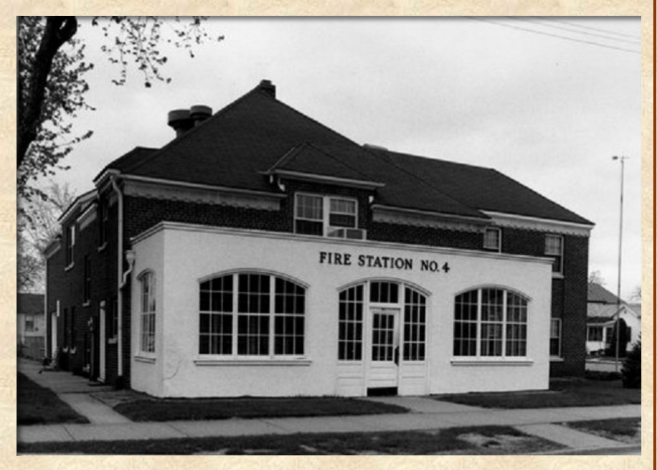
Ca. 1983.

The earliest fire station still functioning, and the only fire station showing the influence of historic architectural styles.