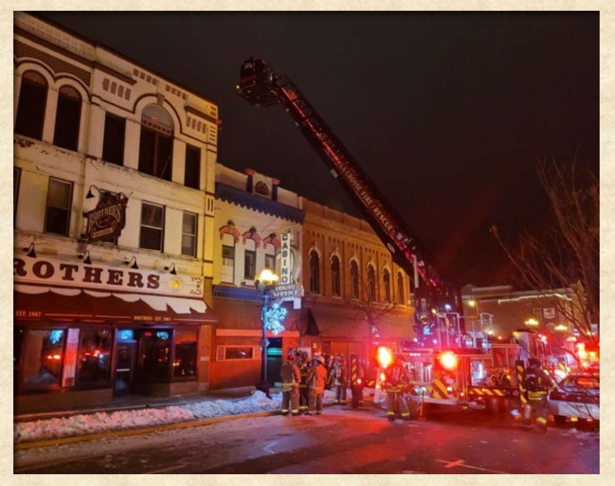
Ca. 2021.

Best remaining example of a 1930's Moderne styled storefront in downtown La Crosse.