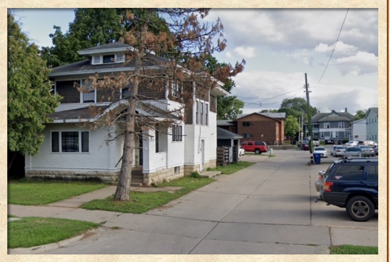
Ca. 2019.

Only a finite number of American Foursquare homes in La Crosse.