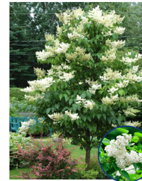
Ivory Silk Japanese Lilac