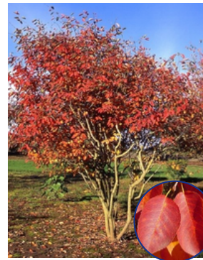
Autumn Brilliance Service Berry

Trees are not guaranteed beyond the first year and plaques are not replaced if damaged or stolen. Trees and plaques are only installed in the Spring and Fall. Scheduling is dependent on contractor availability.