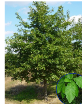
Swamp White Oak *Spring Planting Only